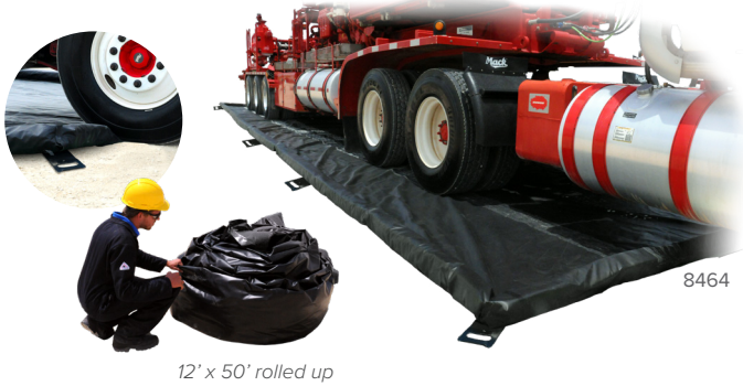
12' x 50' rolled up

Low-profile design is perfect for equipment maintenance and portable drum containment. Low, 4" sidewall contains spills - keeps plant floors and soil free from contamination.